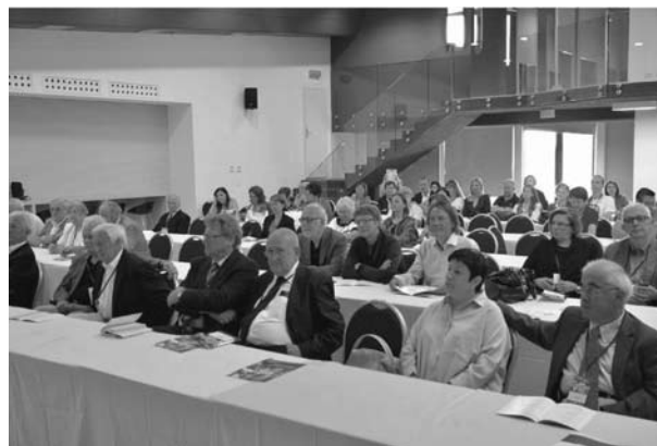
Fig. 1. Opening of the 54 th International Neuropsychiatric Congress in Pula.

The main theme of the congress was Lifestyle and Prevention of Brain Impairment. In addition to lectures on the main theme, the Congress included a number of accompanying symposia, in particular the 3 rd European Summer School of Psychopathology, 7 th International Symposium on Epilepsy, 2 nd Neuro-Interdisciplinary School, 3 rd Symposium on the Interface Providers in Neurorehabilitation, psychiatric symposia on the new Act on the Protection of Persons with Mental Disorders, Symposium on Forensic Psychiatry, symposia on ADHD, on treatment of advanced Parkinson's disease, activities of the Andrija Štampar Association of Public Health in stroke prevention, on a common approach to diagnosis, treatment and follow up of Anderson Fabry disease in South-East Europe region, and on cerebral aneurysms, palliative care, on atrial fibrillation and secondary prevention of stroke, and on different therapeutic approaches in the treatment of neurological and psychiatric diseases. On Saturday, a joint meeting with the Alps-Adria Neuroscience Section,