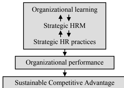
FIGURE 2 The model of organizational learning and strategic HRM for sustainable competitive advantage