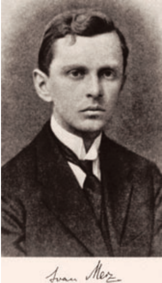
Dr. Ivan Merz