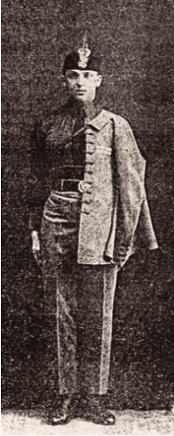
Croatian Orao Uniform

proach. 147 The Orao movement's manner of functioning encompassed a multi-disciplinary approach that particularly emphasized an apolitical orientation with the objective of building a society based on higher values, with special appreciation for each individual and development of the whole person, focused more on internal values and personal growth.