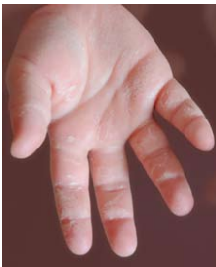
Figure 1. Acral peeling skin syndrome on the hand.

Hematological and biochemical investigations found normal values: complete blood count, erythrocyte sedimentation rate (ESR), C-reactive protein (CRP), serum calcium, magnesium, ALP, iron, total iron binding capacity (TIBC), ferritin, T4, TSH, PTH, 1.25-dihydroxyvitamin D, copper, ceruloplasmin, and total immunoglobulin E (IgE). Antinuclear antibodies