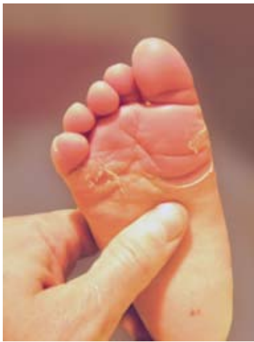
Figure 2. Acral peeling skin syndrome on the feet.

(Sanger sequencing of coding regions and exon-intron boundaries, primers sequences, and PCR conditions available on request).