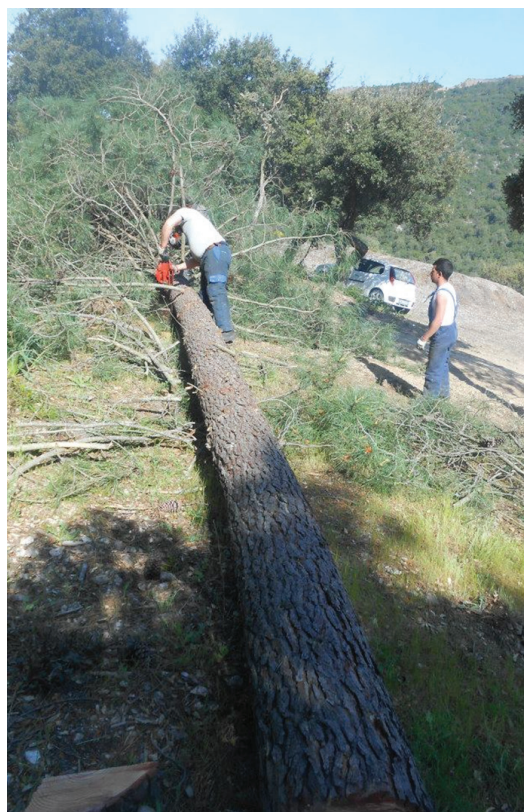
FIGURE 7. The final assortment of the bole into logs

7. By applying the newly developed grading rules, suitable boards will be selected for the production of some prototypes of CLT panels by Area Legno, a CLT producer. These panels will then be tested to destruction to determine their mechanical properties and to correlate them to the properties of the single boards.