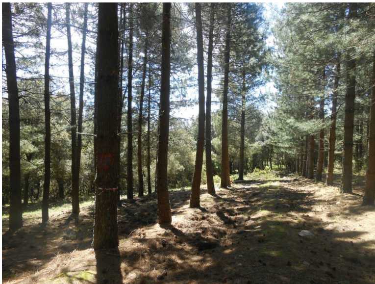
FIGURE 5. Inside the pine plantation