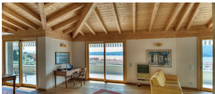
FIGURE 1. Interior of a house where timber has been used for the structural skeleton (walls and roof), for the flooring and for the doors (courtesy of Rubner Holzbau Spa – Bressanone (BZ)).

Timber has also the advantage of being aesthetically pleasing, and therefore it is often chosen by the architects both for finishing and for structural members such as columns, beams and ceilings of floors to create a warm and pleasant living environment (Figure 1). In terms of mechanical properties, it is characterized by an excellent strength-to-unit weight ratio, which is approximately the same as steel and almost five times larger than concrete. These results in lightweight structures, like steel structures, that are approximately five times lighter than reinforced concrete structures. The