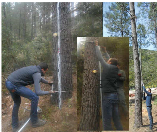
FIGURE 6. The assortment of a standing tree

6. Based on the results of phases #4 and #5, the visual and machine based grading rule for Sardinia maritime pine will be developed and proposed for approval.