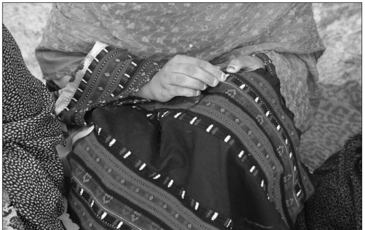
Figure 5 Baluchis women while making needlework handicraft