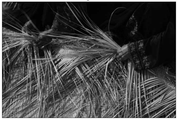
Figure 3 Baluchis women while making handicrafts

Baluchi women withdraw early from the labor force due to the pressure of marriage and childbearing. Ethnic tourism is seen as more "fun" compared to other types of work in Iran's Baluchistan. In this study, the Baluch women's enjoyment of ethnic tourism work came largely from the opportunities it offered in terms of new experiences, learning about different cultures and meeting different people. This includes the opportunity to meet and interact with ethnic tourists, clients and other people.