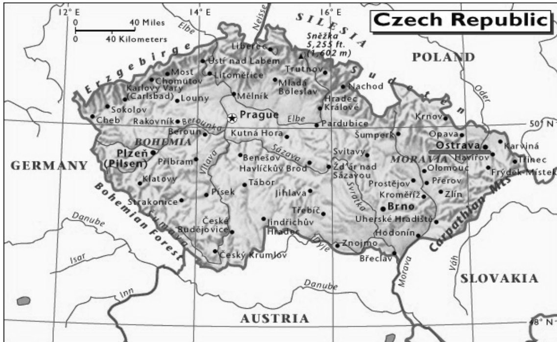
Figure 1 Location of Ostrava