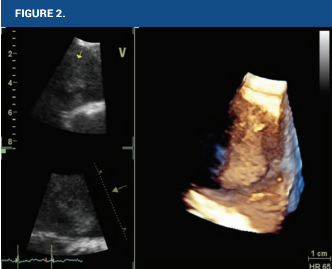
Three-dimensional TTE showing a rihgt ventricle thrombus.

Three-dimensional TTE showing a large left ventricle thrombus.