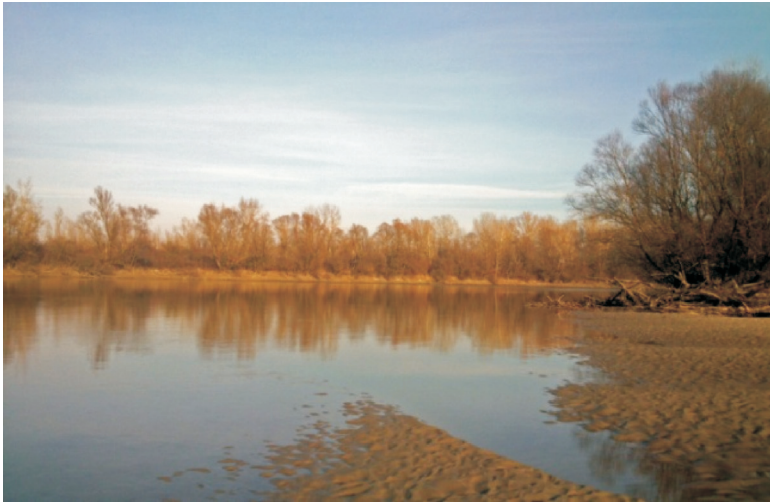
Fig. 2. The Drava River near Donji Miholjac

The length of the Drava River in Croatia is 323 km, a stretch of 136 km forming the Croatian-Hungarian border) (NARODNE NOVINE, 91/08). In the middle reach, when the river enters Croatia, the Drava River is modified by three large hydropower dams (Varaždin, Čakovec and Dubrava) but parts of the lower reaches are near natural (TOMAS et al. , 2013).