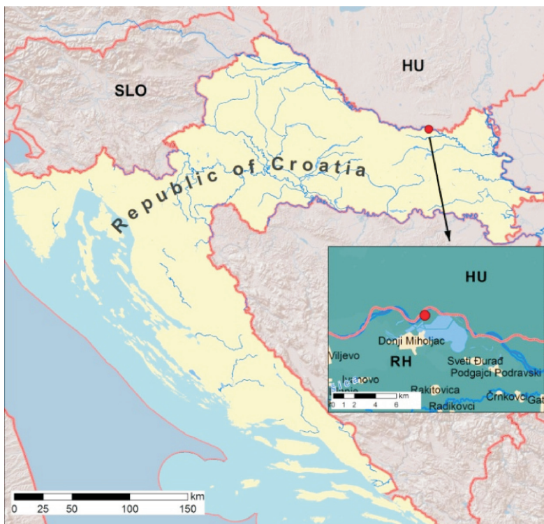
Fig. 1. A map of Croatia with a detail of the studied area

The total length of the Drava River is 749 km with an associated watershed area of 41,238 km 2 (NARODNE NOVINE, 91/08). The river is situated in two ecoregions: the Alps (ER 4) and the Pannonian ecoregion (ER 11) (ILLIES, 1978). The spring is in South Tyrol in Italy (near Lake Dobbiaco), the river continuing through Austria and Slovenia where its upper reaches are used for electricity production. Further downstream it forms most of the border between Croatia and Hungary, then heading back into Croatia again it meets the Danube near the Croatian-Serbian border (near the city of Aljmaš) (Fig. 1).