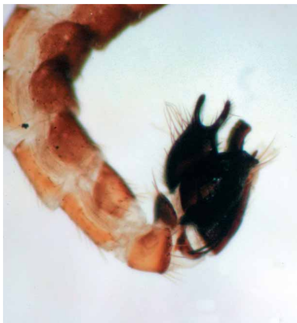
Fig. 1. Male hypopygium of Hemerodromia raptoria (Meigen), left lateral view.

Material examined: Selečki most, Odra River, Turopolje, 97 m a.s.l.: September 5th 2005 (1 ♂); July 30th 2006 (3 ♂, 2 ♀); August 26th 2006 (3 ♀); September 17th 2006 (1 ♂).