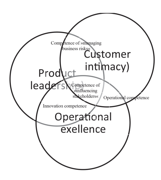
Figure 1 Types of competitive advantage and competences

Figure 1 graphically summarizes the interaction between distinctive ways of competing (product leadership, customer intimacy, and operational excellence) and different types of organizational competences.