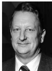
IFAC President 1984–1987