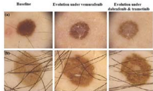
Figure 4. Evolution of reticular-homogenous nevi: (a) diffuse decrease in pigmentation and central involution during vemurafenib treatment, followed by further decrease in pigmentation during dabrafenib and trametinib therapy; (b) diffuse increase in pigmentation during vemurafenib treatment, followed by diffuse decrease in pigmentation, and central involution during dabrafenib and trametinib therapy.

After one month of vemurafenib treatment, the patient returned to our Department for follow-up skin examination. The patient's general state and effort tolerance were very much improved, and the left axillary tumorous mass, the right malar and right parasternal nodules were no longer present on inspection and palpation. Multiple new reticular nevi and seborrheic keratoses had occurred. Results of routine laboratory exams were within normal limits, as was S100 serum level (0.08 µg/L). Computed tomography examination was repeated in December 2013 and showed the resolution of all secondary tumors (left axillary lymph