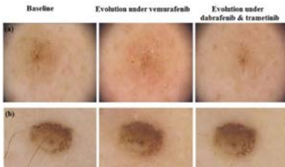
Figure 6. Evolution of globular nevi: (a) diffuse decrease in pigmentation during vemurafenib treatment, followed by further decrease in pigmentation during dabrafenib and trametinib therapy; (b) diffuse decrease in pigmentation during vemurafenib treatment, and stable nevus during dabrafenib and trametinib therapy.