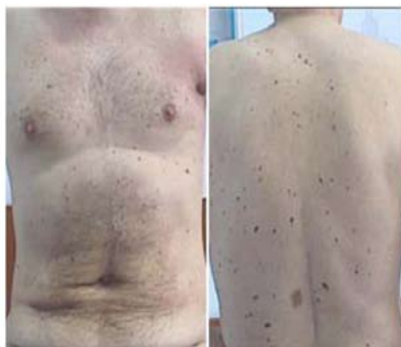
Figure 2. Numerous nevi on the patient's torso.

Laboratory analyses yielded leukocytosis ( 11.5 \times 10^3/\mu\text{L} ) with neutrophilia ( 8.52 \times 1010^3/\mu\text{L} ), associated with a mild biological inflammatory syndrome (erythrocyte sedimentation rate (ESR)=36 mm/h, Fibrinogen=454 mg/dL and positive C reactive protein (CRP)) and an elevated lactate dehydrogenase (LDH) level of 648 U/L (normal value <220 U/l). S100 serum level was increased at 2.28 \mu\text{g/L} (normal values <0.15 \mu\text{g/L} determined by chemiluminiscence), while carcinoembrionic antigen serum level was 1.52 ng/mL