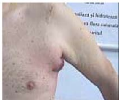
Figure 1. Tumorous mass on an erythematous background in the left axillary area.

We noted more than 100 melanocytic nevi on the patient's trunk and limbs (Figure 2), of which 65 were examined by the aid of digital dermoscopy. The dermoscopic pattern of the examined nevi was as follows: 40 (62%) reticular, 15 (23%) reticular-homogenous, 8 (12%) reticular-globular, and 2 (3%) globular.