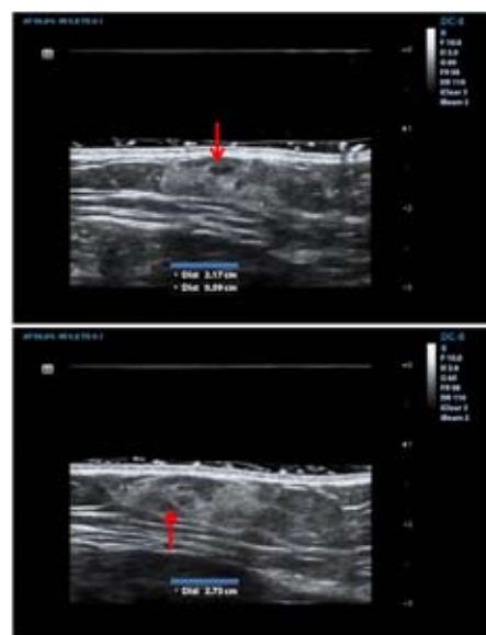
Figure 1. Ultrasound scan of subcutaneous cavernous angiolipoma: a non-homogeneous sonographic appearance due to vascular lacunae engorged by blood (red arrows), is noticeable.

For the first time in the literature, we report a case of subcutaneous cavernous angiolipoma. This new soft-tissue entity should be reserved for subcutaneous angiolipoma with very large vascular gaps, haphazardly arranged and engorged by blood. The first and only description of a cavernous angiolipoma dates back to 2008, when Farooq and colleagues described