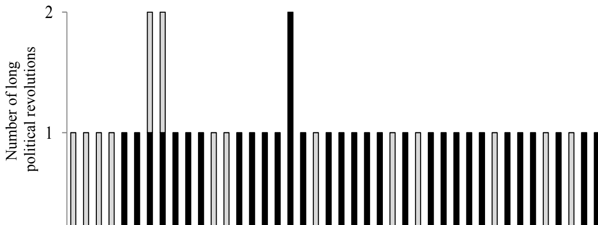
Figure 2. Number of long political revolutions that occurred around world in the 20 th century, by duration in months. Black bars denote successful, and grey unsuccessful political revolutions.