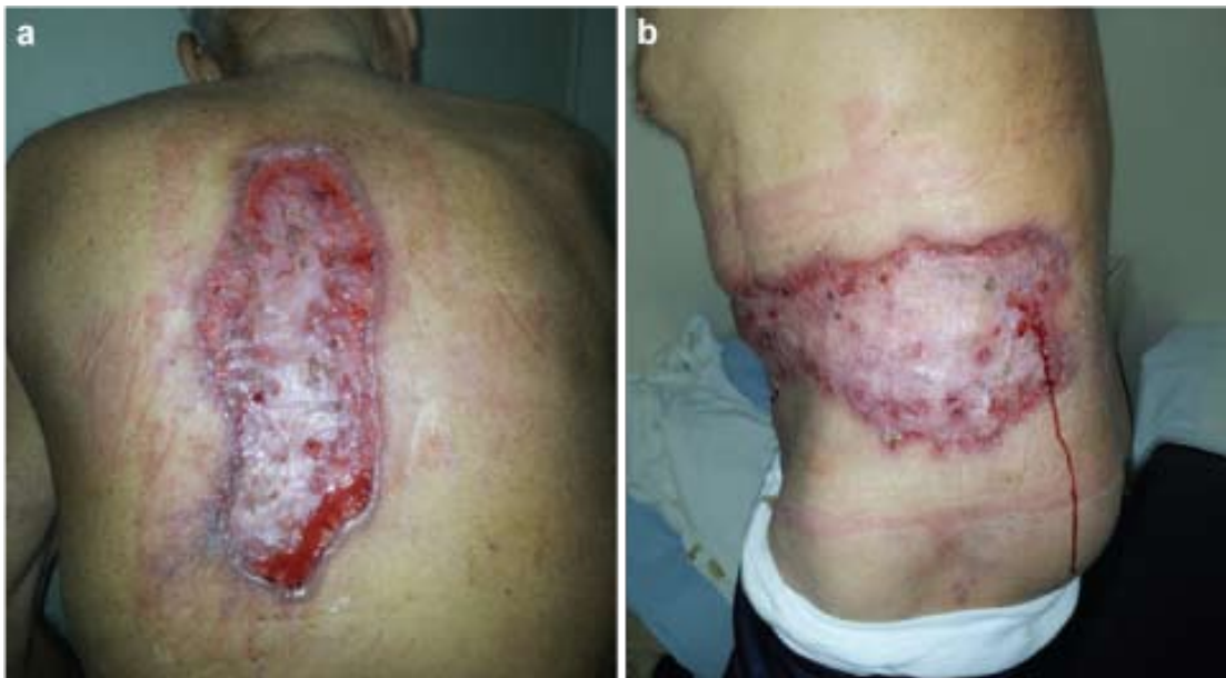
Figure 1. Clinical findings in our patient at admission: two extensive, necrotic ulcerations with irregular, violaceous, undermined borders; one presented on the back (a), the other over the lower left abdomen (b).

necrobiosis lipidica, arterial or venous insufficiency, antiphospholipid-antibody syndrome, gangrenous thrombophlebitis, systemic lupus erythematosus, Behçet disease, Wegener's granulomatosis, and polyarteritis nodosa (1,3,8). The first line of treatment includes systemic corticosteroids or immunosuppressive drugs together with treatment of the associated systemic disease (7,9,10).