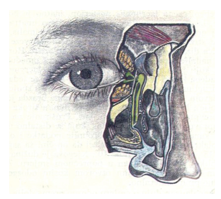
Fig. 1. Schematic presentation of the topographic anatomy of the lacrimal drainage canals.