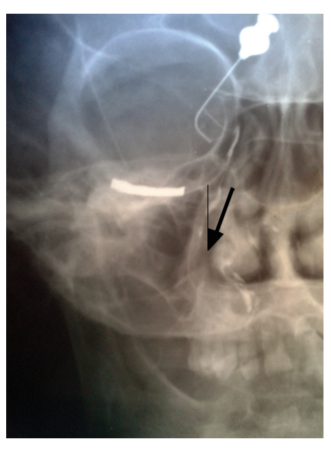
Fig. 3a. Projection in the frontal plane, alpha angle greater than 91°, with imagined intersection of directions of nasolacrimal canals on glabella (24%).

Examination was performed on 30 patients whose age ranged from 10 to 80 years; 14 of them were women. One milliliter of Omnipaque contrast was injected into the nasolacrimal canal, through the superior lacrimal punctum. Thereafter, X-ray examination in two directions