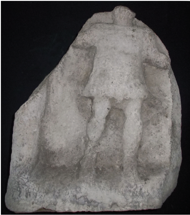
Sl. 5 Reljef s prikazom Silvana pronađen u Ograji, Putovići Fig. 5 Relief depicting Silvanus, found in Ograji, Putovići

prikazuju Silvana i/ili Dijanu (sl. 5–7). Ovi drugi ulomci spomenika s prikazom bogova s istog nalazišta prikazuju nam boga kojeg smo vidjeli na većini spomenika iz Dalmacije. Na osnovi te činjenice, sasvim je opravdano pretpostaviti da je ovo nalazište bilo Silvanovo (i Dijanino) svetište.