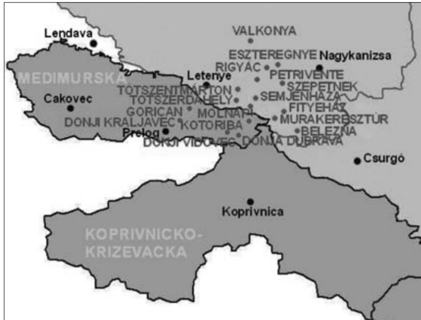
Figure 2. Mura Region EGTC 1

Legend: The members of Mura Region EGTC are signaled with red