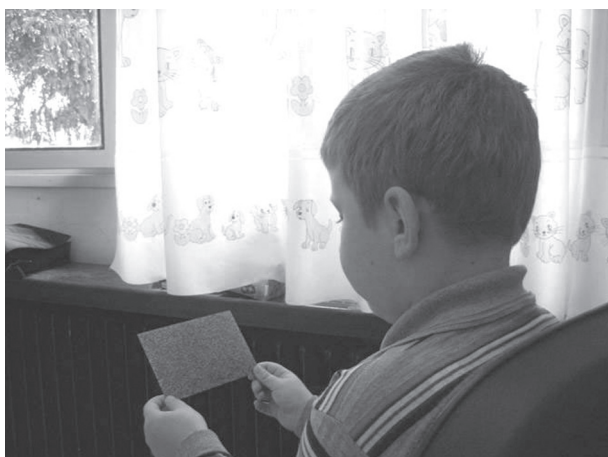
Fig. 2. Examination of stereopsis with Lang I stereotest.

the following shapes: cat 1200", star 600" and car 550 seconds of arc. The shapes in Lang-test II are: elephant 600", car 400" and moon 200 seconds of arc. Lang stereoaucuity tests are very useful for examination in children. The test plate is presented at 40 cm in front of the child and the examiner controls the child's reactions, eye movements and face expressions (Fig. 2). The result is positive when the child recognizes the figures and names the pictures with determination of their position in the space (older children).