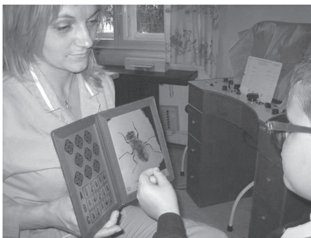
Fig. 3. Examination of stereopsis with Titmus test. Stereoaucuity on Titmus house fly test is 3000".

The Titmus stereotest 8 provides assessment of stereoaucuity in the range from 3000" (housefly wings appear above the background plane and the child tries to catch the wings of the fly) to 40 seconds of arc (nine circles in stereoaucuity at 800", 400", 200", 100", 80",