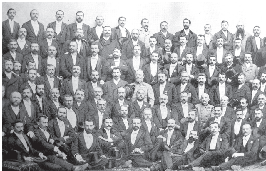
Fig. 4. Croatian physicians at the ceremony celebrating the 25 th anniversary of the Croatian Medical Association in 1899 (sic. no woman!).

The latter feature, i.e. the servile, submissive, colonialist way of adopting Anglo-Saxon medical terminology and eponymy, has now got completely out of hand,