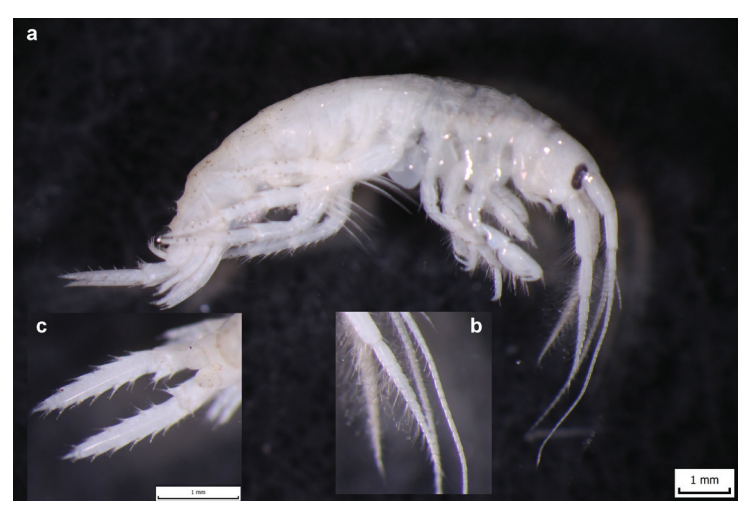
Fig. 1. a) Male specimen of Echinogammarus ischnus from the site Drava-Osijek sampled on 13<sup>th</sup> February 2015; b) detail of flagellum of antenna with characteristic long, curly and abundant setation on second antenna; c) third uropods (U3) and telson viewed from above.

the easternmost border of Croatia with Serbia. Five alien amphipods, Dikerogammarus villosus , D. haemobaphes , D. bispinosus , Obesogammarus obesus and Chelicorophium curvispinum are known to be present in large rivers of Croatia, their distribution being established in a previous study (ŽGANEC et al. , 2009).