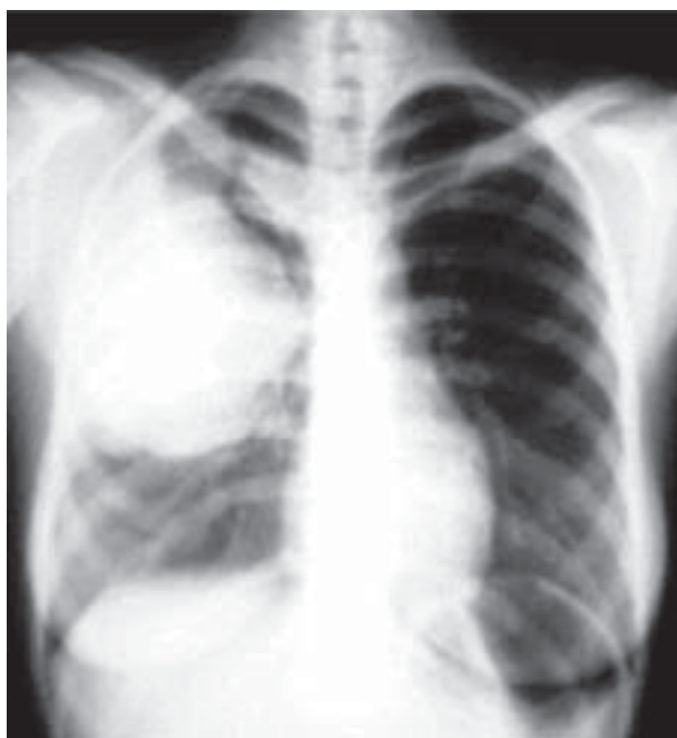
Figure 1. A giant right chest tumor mass spreading from hilus to chest wall

provide any improvement. Apart from childhood pneumonia and surgery for treatment of appendicitis, the patient's medical history included no other diseases. She occasionally took nonsteroidal antirheumatics for pain.