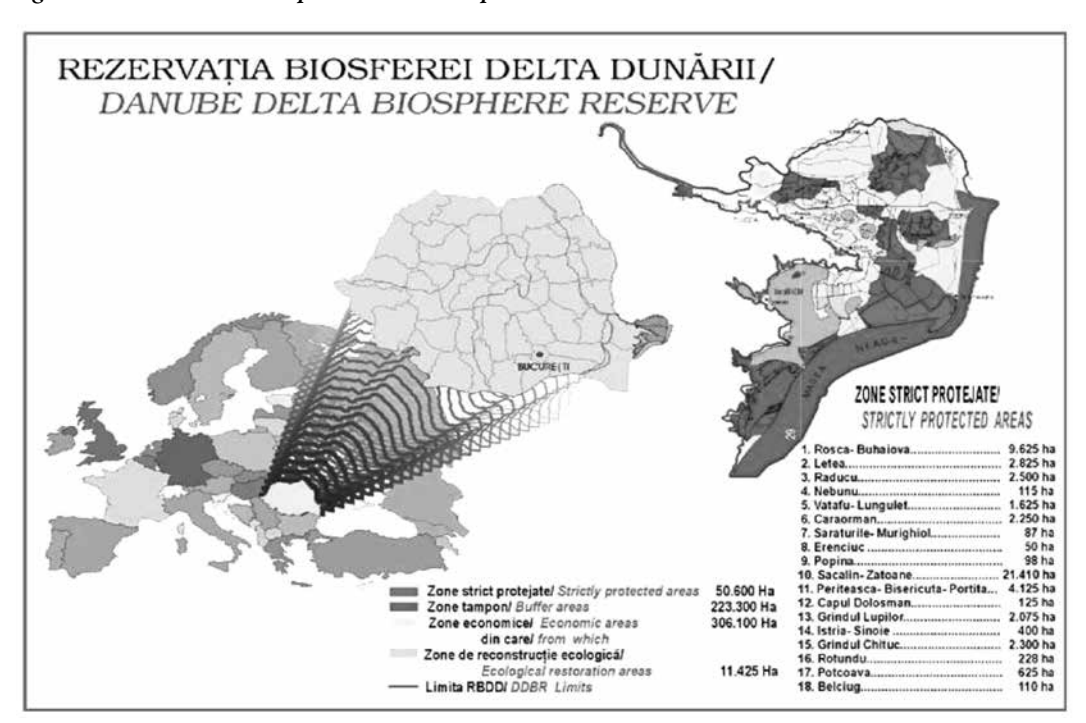
Figure 1 Danube Delta Biosphere Reserve Map

Source: Danube Delta Biosphere Reserve Authority, Available at: http://www.ddbra.ro/en/ddbra-map (Accessed on: January 23, 2014)