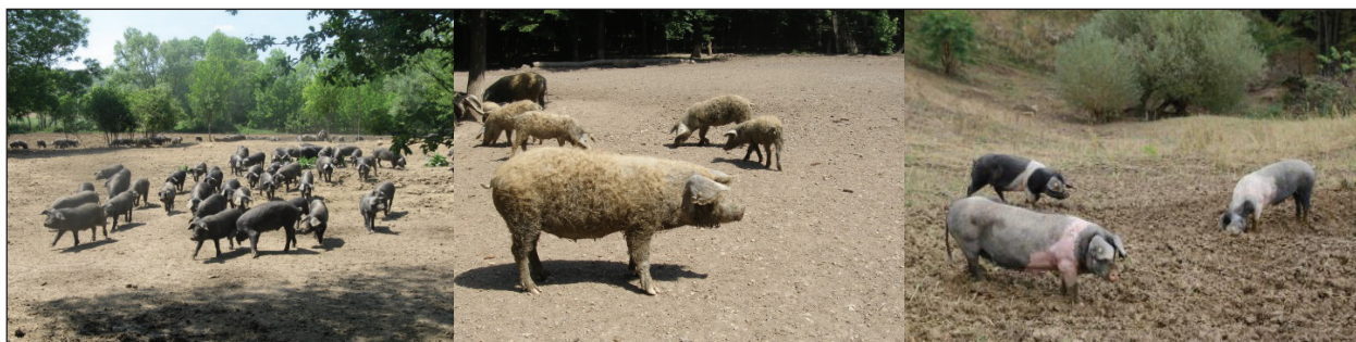
Figure 1. Croatian local pig breeds Black Slavonian (left), Turopolje (middle) and Slovenian local pig breed Krškopolje breed (right) will be studied in H2020 project TREASURE

In this project the breeds from Croatia and Slovenia are also included, namely the Black Slavonian (Crna slavonska svinja), Turopolje (Turopoljska svinja) from Croatia and Krškopolje (Krškopoljski prašič) from Slovenia. In the past years due to many efforts these breeds have been preserved from extinction. However, they remain untapped, with their potential little explored and exploited. This denotes a special interest of the stakeholders to benefit as much as possible from the activities and network of the TREASURE project. Following is the description of the project activities scheduled for these breeds.