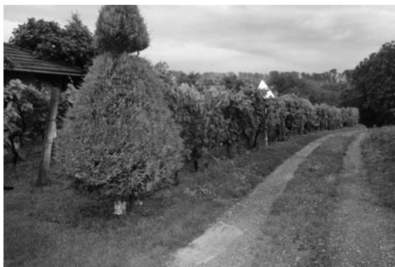
Vineyard Cottage road

Ovaj članak sažima istraživanja i preporuke koje proizlaze iz Projekta održive prehrane i poljodjelstva održanog u proljeće i ljeto 2014. godine u Koprivnici, Hrvatska. Projekt je nastao u suradnji Sveučilišta Arizona State iz SAD i znanstvenika, vladinih dužnosnika, poslovnih ljudi, poljoprivrednika i drugih učesnika u Koprivnici i široj regiji Podravine, temeljeći se na povijesnim i sadašnjim uvjetima lokalnog sustava proizvodnje hrane i poljoprivrede. Projekt je rezultirao preporukama kako izgraditi otpornost i održivost u tom sustavu u narednih 30 godina. Razvoj održivog lokalnog sustava prehrane uključuje daleko više od kvalitetne poljoprivrede i snažnih ekoloških mjera u očuvanju prirode; uključuje razmatranja o kvaliteti života, ekonomiji sustava prehrane, politike i upravljanja, kulturne baštine i socijalne pravde. Započinjemo određivanjem postojećih izazova i problema u održivom sustavu prehrane u Podravini; zatim procjenjujemo prepreke i mogućnosti za izgradnju održivog i otpornog sustava farmi i proizvodnje hrane u regiji; završavamo praktičnim preporukama za jačanje održivih ustava proizvodnje hrane i poljoprivrede u Koprivničko-križevačkoj županiji i široj regiji Podravine.