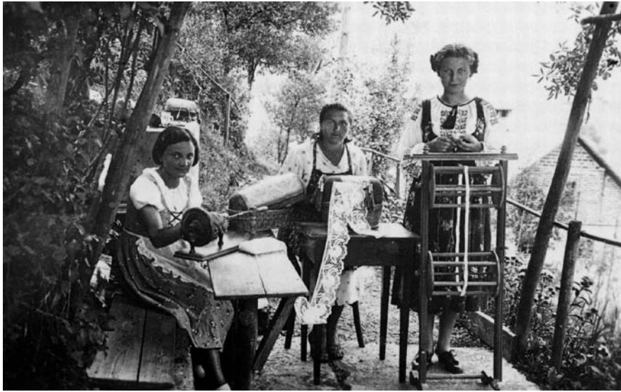
Figure 5: Idrija lace makers during the interwar period.*

* Terpin Mlinar, M. 2010: Idrijska čipka. In: Na prelomnici: razvojna vprašanja Občine Idrija. Ljubljana, Založba ZRC, p. 199.