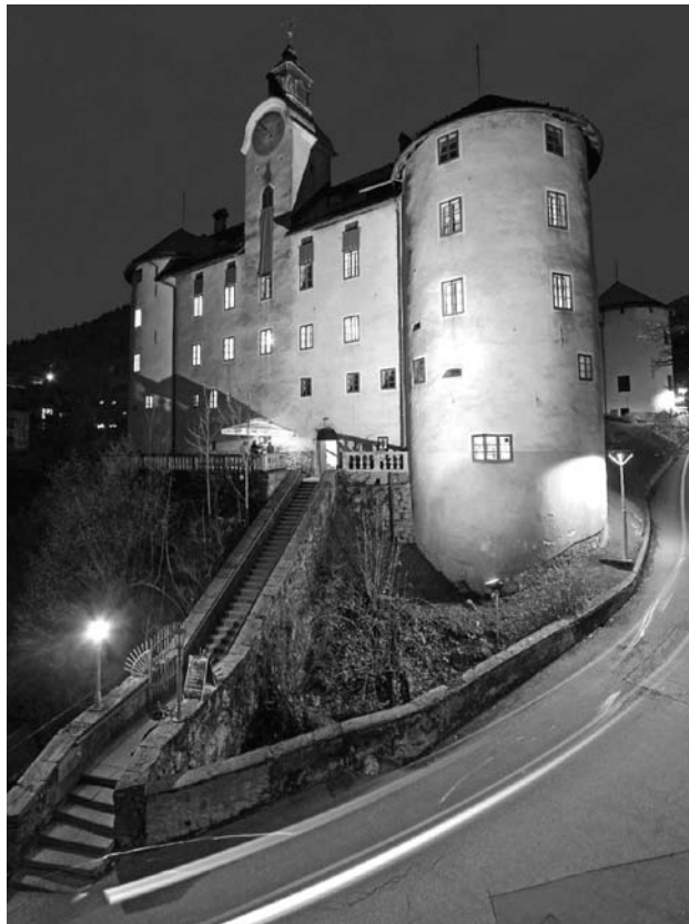
Figure 6: Gewerkenegg Castle in Idrija was built between 1522 and 1533. It was occupied by the mine administration for more than 400 years and now houses the Idrija Municipal Museum*.

After production was stopped, mercury concentrations in the air and water decreased significantly, but mercury deposits in alluvial sediments and the soil have remained problematic. 56 Accordingly, pregnant women