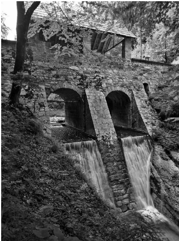
Figure 3: Logging sluices were built on rivers from the sixteenth century onwards for moving timber downstream for use by the mine. The photo shows the Brus Sluice (also known as the Belca Sluice; photo: Bojan Erhartič).