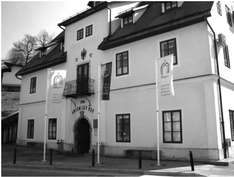
Figure 7: Anthony's Main Road («Antonijev rov») is the oldest part of the Idrija mine and is one of the oldest preserved entrances into any mine in the world; it was excavated only a decade after the initial discovery of mercury. Today this is the entrance to the Mine Museum.

* Kavčič, M., Peljhan, M. 2010: Geological heritage as an integral part of natural heritage conservation through its sustainable use in the Idrija region (Slovenia). Geoheritage , 2, p. 150.