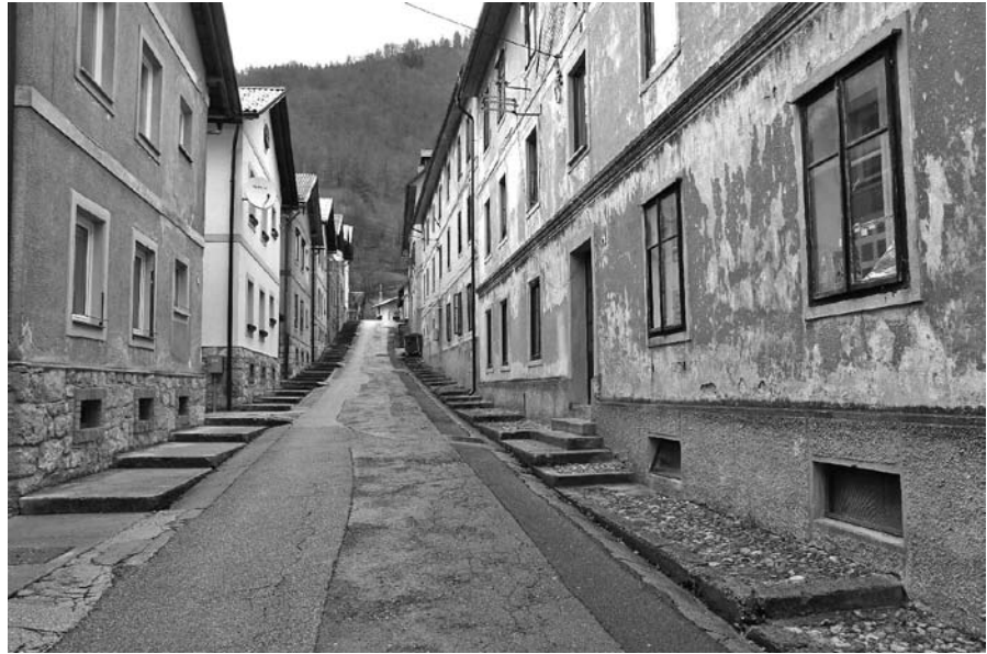
Figure 8: Miners' houses and apartment blocks from the end of the nineteenth century are an important part of world heritage.

tenance and tourism functions. The town is prospering from its newly developed electrical industry and it is using the heritage of its mercury mine to develop cultural tourism. 85