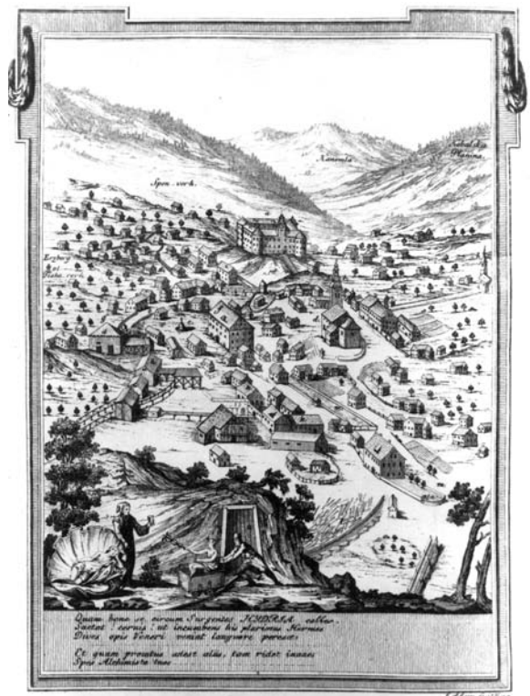
Figure 2: Idrija around 1750 (source: Balthasar Hacquet, Oryctographia Carniolica II , 1781).

(known as the kamšt ). 15 This waterwheel had a rotation speed of four to five turns a minute and pumped three hundred liters of pit water per minute from 283 meters below the surface. 16