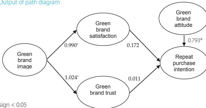
Figure 2: Output of path diagram