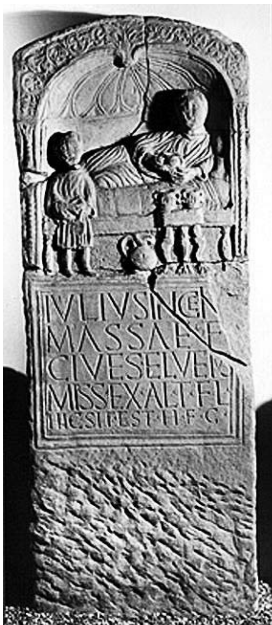
Sl. / Fig. 4: Stela isluženog vojnika ( missicius ) prve ale Flaviane iz Klein-Winterheima / Stele of a missicius of the ala I Flaviania from Klein-Winterheim ( Lupa 15873)

gao biti posve neobrađen ili pak površno obrađen zubatim dlijetom kao na usporednim primjerkima iz Germanije ( Lupa 15873, 15539) (sl. 4). 30