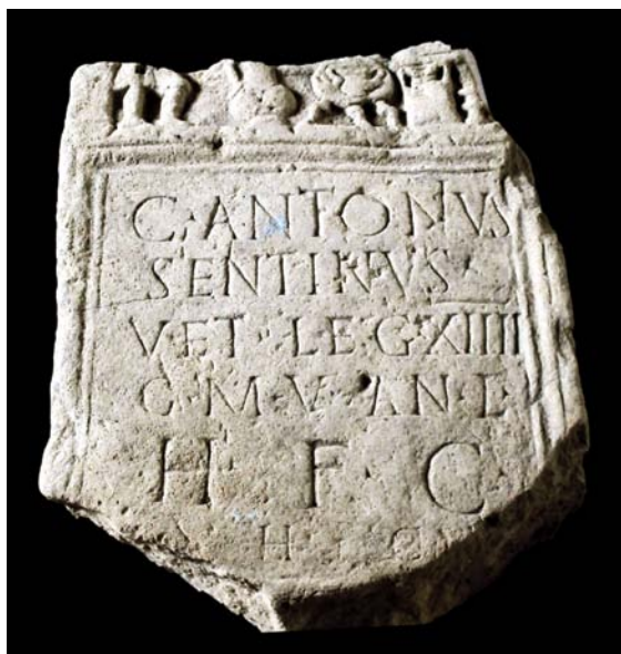
Sl. / Fig. 2: Stela Gaja Antonija Sentina, Gradski muzej Sisak, inv. br. 22659 / Stele of Gaius Antonius Sentinus, The Town Museum of Sisak, inv. no. 22659

gu (potkoljenica i stopala) u profilu, odnosno u koraku nadesno. Tunika, koja doseže do koljena, prikazana je poput teške tkanine bez izraženih nabora. Preostali dio prizora čini okrugli tronožni stol, a na podu sa svake njegove strane po jedna izrazito velika posuda. S lijeve je strane vrč kruškolikoga oblika s izvijenom ručkom koja doseže do oštećenoga oboda, a s desne četvrtasta boca s dvije koljenaste ručke koje ne prelaze razinu ulegnutoga prstenasto obrubljenoga otvora. Tronožac je prikazan odozgo ukoso tako da su mu vidljive ne samo izvijene noge sa završecima u obliku stiliziranih lavljih šapa nego i okrugla gornja površina, gotovo u potpunosti zapremljena trbušastim kantarom na niskoj stožastoj nozi, s dvjema velikim ručkama koje pod kosim kutom nadvisuju ravni prstenasti obod. Između vrča i stola, te poviše boce vodoravno se proteže uska letva koja je očito rub nekoga predmeta od kojeg je iznad boce sačuvan i mali komad površine iznad ruba. Kratki potez te letve sačuvan je i lijevo od ručke vrča, ali je otučen na potezu između toga mjesta i koljena ljudskoga lika. Krajnji desni predmet – valjkasta noga s tri prstenasta zadebljanja, koja je u gornjemu dijelu oštećena, ali je jasno da se proteže sve do opisanoga ruba, otkriva da je posrijedi prikaz ležaja ( klinē ) od kojega su vidljivi samo donji rub i desna noga. Druga noga