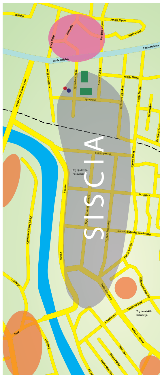
Sl. / Fig. 1: Karta Siscije s naznačenim okolnostima pronalaska stele. Sivo – Siscia intra muros ; crvena točka – lokacija pronalaska stele; plava točka – lokacija pronalaska groba; zeleno – istraženi i djelomično istraženi dijelovi lokaliteta Sv. Kvirin; roza – Sjeverna nekropola; plava trasa – cesta prema Andautoniji; narančasta područja – nekropole / Map of Siscia with finding circumstances marked. Grey area – Siscia intra muros ; red dot – find-spot of the stele; blue dot – find-spot of the grave; green area – completely or partially explored sections of the Saint Quirinus site; rose area – North cemetery; blue route – the road to Andautonia; orange areas – cemeteries (karta / map by Maximativa d.o.o.)

Dosadašnjim istraživanjima identificirano je ukupno šest antičkih nekropola na području Siska: četiri na lijevoj obali Kupe i dvije na desnoj u Novom Sisku. 8 Najbliža je mjestu pronalaska nadgrobne stele Sjeverna nekropola. Bila je smještena uz cestu Siscia – Andautonia – Poetovio čija trasa je prolazila oko 250 m sjeverno od današnje Kvirinove ulice u pravcu istok – zapad (ispod današnje Ulice Ferde Hefelea i Zagrebačke ulice). Od ove se ceste kod stanice Ad Fines (Buševac?) granao odvojak koji je preko Nevioduna vodio do Emone. 9 Odsječak Siscia – Neviodunum – Emo-