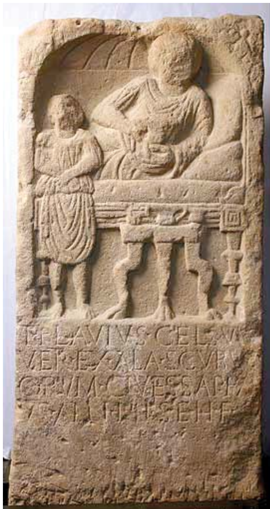
Sl. / Fig. 7: Reljefna niša stele veterana ale Skubula iz Wiesbadena / Relief niche of the stele of a veteran of the ala Scubulorum from Wiesbaden (Lupa 7071)

već u 1. stoljeću. Nadalje, to je jedini spomenik takvoga tipa u zapadnim provincijama nađen na području istočno od crte koju je činio Dunavski limes u Reciji i Rajnski u Germanijama. 90 Taj je podatak u skladu s činjenicom da je izvor novčenja sredinom 1. stoljeća, kad pretpostavljamo Sentinovo pristupanje vojsci, bio u sjevernoj Italiji i najsnažnije romaniziranim provincijama, odnosno rano ustanovljenim kolonijama zapadnoga dijela Carstva, što Panonija u to vrijeme nije bila. 91 Najraniji grobni spomenik iz Siscije, datiran