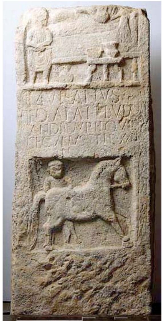
Sl. / Fig. 5: Stela konjanika prve ale Flaviane iz Wiesbadena / Stele of a horseman of the ala I Flaviana from Wiesbaden ( Lupa 7073)

Prethodno navedene usporedbe u germanskoj građi pružaju kronološki okvir siscijske stele, a to je flavijevsko-trajansko razdoblje koje je, usprkos nizu pojedinačnih nedoumica, na području obiju Germanija dobro dokumentirano. 41 Ostaje otvoreno pitanje gornje granice s obzirom na to da se vojničke stele s prizorom blagovanja provlače gotovo do sredine 2. stoljeća. Međutim, u dostupnoj literaturi nije mi poznat nijedan primjer stele iz toga razdoblja s ikonografskom shemom zastupljenom na siscijskome spomeniku. Naime, u 2. stoljeću prevladavaju obiteljske slike s prizorom žene koja sjedi na stolici uz pokojnika te još jednim slugom, a potom i većim brojem likova. 42 U flavijevsko-trajanski okvir uklapa se i podatak da je 14. legija napustila Mogontijak najkasnije početkom 2. stoljeća (o tome opširnije u podnaslovu Prozopografija ). Otprilike u to vrijeme prestaje izrada stela s prizorom gozbe u Mogontijaku, a još neko vrijeme traje u Koloniji Agripini gdje se, međutim, već od početka 2. stoljeća razvila u već spomenutome pravcu obiteljskih prizora. 43 Važno je napomenuti da 14. legija nije nastavila