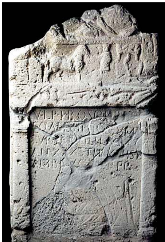
Sl. / Fig. 6: Stela konjanika treće ale Tračana iz Petronella / Stele of a horseman of the ala III Thracum from Petronell ( Lupa 88)

3 rd -century stelai from Pannonian towns on the Danube limes in Hungary were possibly made on the model of the pattern brought to Pannonia by the soldiers from the Rhineland, given that they feature a single reclining deceased. Nevertheless, all those stelai are later in date and are quite different from the Germanic prototype in terms of structure and iconography. Therefore, they can only be interpreted as a far cry from the original model of the Rhineland army workshops. 46 Only several fragmentary examples of fairly crudely executed steale are known from the Raetian limes , which cannot be meaningfully compared with the Siscian stele. Thus, at this stage they should also be considered as a far cry from the Rhineland production. 47