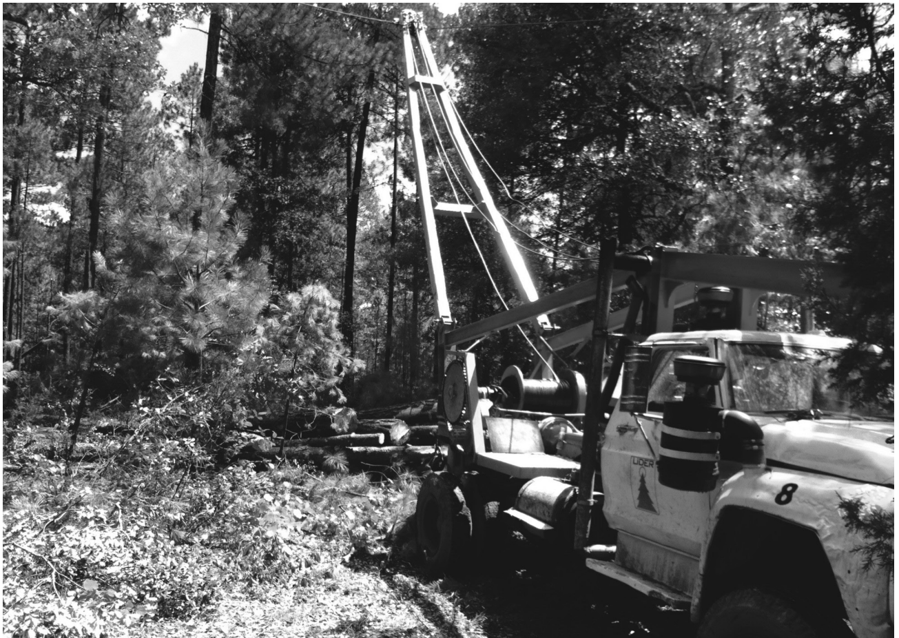
Fig. 1 Jammer with one reel, which is the type commonly used in timber harvesting operations in Mexico

reverse the balance of the initially perceived benefits in the medium and long term (López 2009).