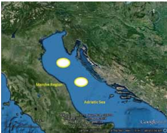
Fig. 1 Location of the two sampling areas

2008; CAMPANELLI et al. , 2011). These particularly cold and dense waters have different chemical and physical features and may cause changes of currents with possible modifications in the biogeochemical and spatial distribution of the sediments.