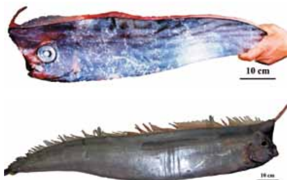
Fig. 1. Crested oarfish, Lophotus lacepede Giorna, 1809. A. specimen 134 cm TL captured off Halkidiki Peninsula (Northern Aegean Sea) and B. specimen 85 cm TL caught on the coast of Mochlos village, Sitia, the island of Crete (Southern Aegean Sea)

The mouth is small and protractile. The teeth are pointed and conical, set in three irregular rows in both jaws although more irregularly planted in the maxilla. There is a small patch of pointed teeth on the vomer inclined inwardly to the pharynx. Lateral line is present. In the body cavity there is an elongated gland, filled with thick black liquid like ink. It starts at the esophagus and extends to the anus. Regarding feeding, remains were found in the stomach belonging: (a) to at least three small individuals of bony