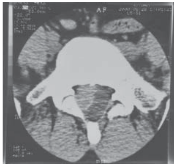
Fig. 3. CT scan showing dorsolateral right-sided extrusions at L5-S1 level.

All patients underwent surgery. In most cases, microdiscectomy, flavectomy and interlaminectomy were performed. In some cases, laminectomy had to be done for spinal canal stenosis. Postoperatively, the patients experi-