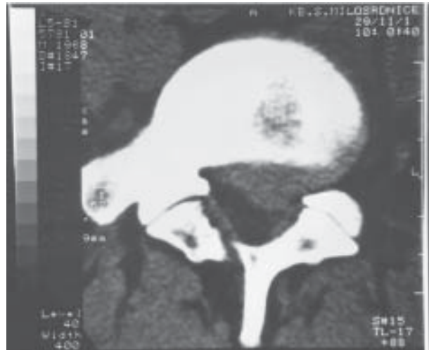
Fig. 2. CT scan showing sequestered dorsolateral left-sided disk extrusion at L4-L5 level.

The diagnostic procedures used in the study were computed tomography (CT) and magnetic resonance imaging (MRI) of the lumbosacral spine. Sequestered lumbar disk extrusions were mainly located at L4-L5 and L5-S1 level, and less commonly at L3-L4 level. According to clinical