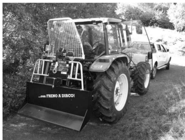
Fig. 1 Farm tractor with Maxwald hydraulic single drum winch