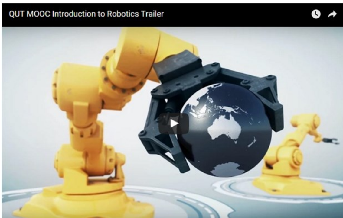
Figure 2. MOOC Introduction to Robotics.