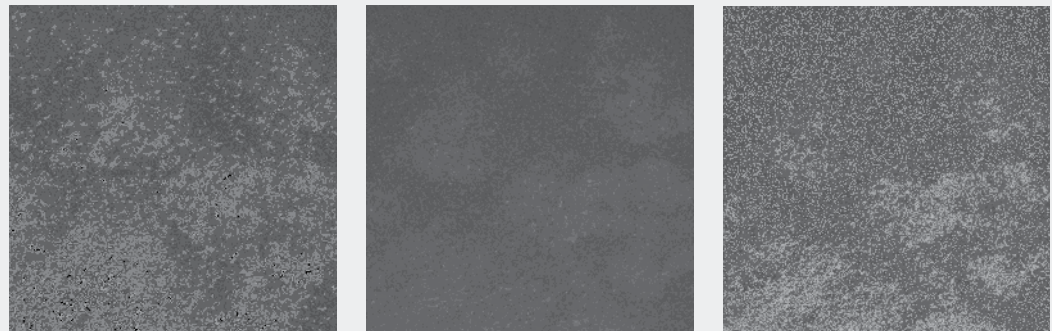
Fig 1. CLSM images of fluorescent Pseudomonas aeruginosa biofilm cultured on membrane filters. 43 (A) Fluorescence of the biofilm bacteria. (B) Fluorescence of the dye that stains EPS and bacteria. (C) Fluorescence images of (A) and (B) overlaid.

strate for biofilm formation. Whereas biofilm on the wound surface may be reasonably easy to remove atraumatically using debridement methods such as swabs, fabric pads or curettage, slough is more contiguous with the underlying wound tissue and can be more difficult to remove. 20-21 In addition, proteinaceous, devitalised host tissue may be more responsive to enzymatic or autolytic debridement than the complex EPS of biofilm, 20 which may be a way to distinguish between slough and biofilm.