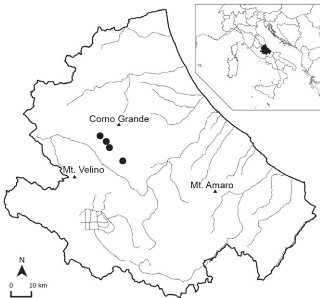
Fig. 2. Distribution map of Alyssum desertorum in Italy (circles).

Distribution in Italy (Fig. 2): Abruzzo region (central Italy), municipality of L'Aquila in the territory of National Park of Gran Sasso and Laga Mountains and surrounding areas. The previous record from Genova (north-western Ita-