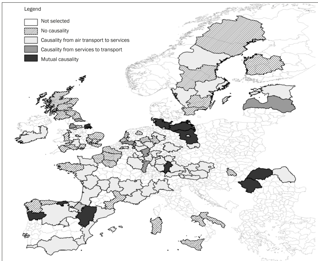
Figure 2 – The different causality relationships between passenger volume and services employment among the 112 European NUTS2-regions

For the link between air passenger transport and employment in the services sector, there is a clear geographical divide. Except for the presence of causality running from air passenger transport to employment in the central European polygon, the abundance of such links frequently holds for the NUTS2-regions in Spain and Southern France. Tourism, which is comprised in our services indicator, possibly plays an important role here. A major part of passengers arriving in South-European regions are tourists stimulating employment in the tourist industry. This is obviously related with the emergence of low-cost carriers (LCCs) after intra-European air transport liberalization [59]. A large part of their networks are clearly designed to