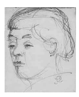
13. Jean-Paul Clarke, Portrait of a woman, three quarters left profile / Jean-Paul Clarke, Portret žene, tročetvrtinski profil ulijevo

These two drawings, mostly the first one, are similar to the highly animated Male portrait , en face (Fig. 12), created in pencil on paper, signed with a similar signature to that on Four boys and one portrait of a little girl (Fig. 10, Cat. 6). It is not dated, and the size is unknown; we do not know even where it is, which is similar to the case of the sketchy drawing Portrait of a woman , three quarters left profile (Fig.