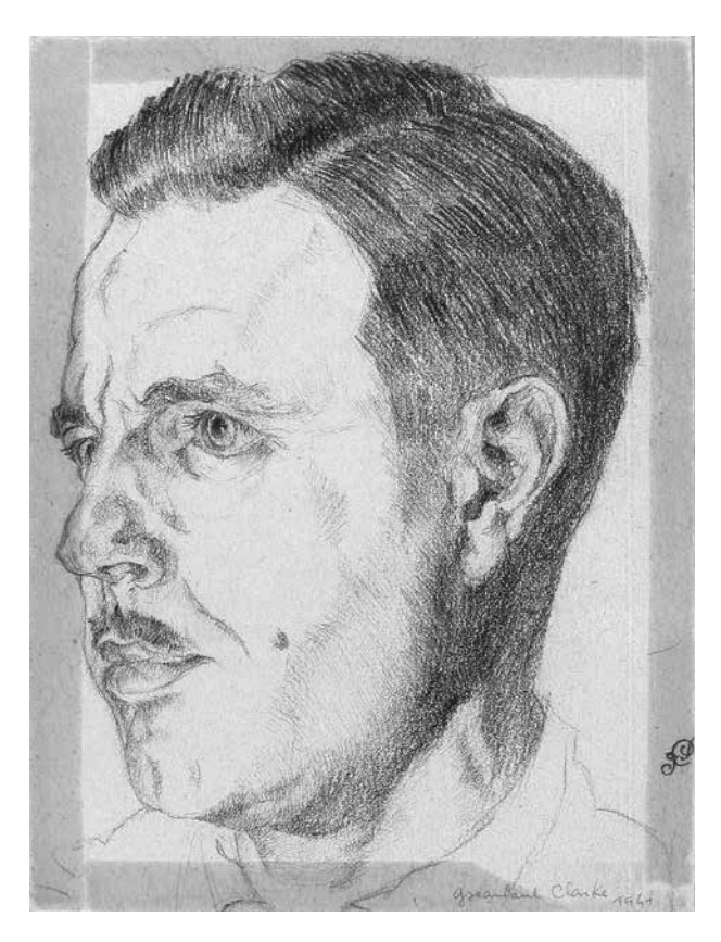
5. Jean-Paul Clarke, Portrait of a man with a piercing gaze, three quarters left profile / Jean-Paul Clarke, Portret muškarca prodornog pogleda, tročetvrtinski profil ulijevo

The drawing Portrait of a man, right profile (Fig. 7, Cat. 3) was done in pen and ink with white gouache highlights, <sup>19</sup> and is sized 94 \times 73 mm. Bottom left, the picture is signed with the monogram, as were the two previous portraits. This drawing is a bit sketchier than the previous two, and the figure is shown in something of a caricature. This does not reduce the intensity of the depiction of the interior life of the model. Unlike the previous two drawings in which the likenesses of a powerful soul were shown, which only with difficulty can be thought to portray a prisoner of war, the view of this man shows his concern. His face is relaxed and seems to have come to some spiritual loss. Clearly the years in the prison have taken their toll, or perhaps it was only a momentary sinking of morale. This drawing is signed with a monogram similar to those on the previous two drawings. In the right hand corner of the paper an irregular piece is missing.