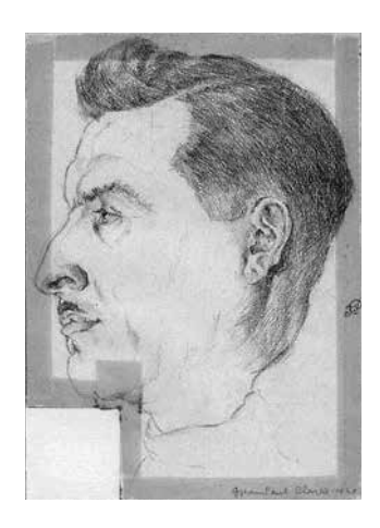
6. Jean-Paul Clarke, Portrait of a man with a piercing gaze, left profile / Jean-Paul Clarke, Portret muškarca prodomog pogleda, profil ulijevo

The next drawing, Portrait of a man, left profile (Fig. 8, Cat. 4) was done in pen and brown ink on paper. It is 137 × 105 mm in size, and is signed, bottom right, in pencil, GJeanPaul Clarke and dated with the year 1943. Over it is the monogram JPC, different from the previous versions, and framed with a square frame which is interrupted at