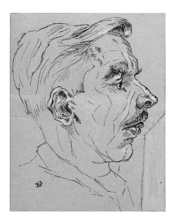
7. Jean-Paul Clarke, Portrait of a man, right profile / Jean-Paul Clarke , Portret muškarca, profil udesno

the bottom of the left vertical near the letter J. The figure is shown fairly sketchily, as is the figure in the next drawing, Portrait of a man with lowered gaze, left profile (Fig. 9, Cat. 5), done in the same technique, sized 108 \times 98 mm. The drawing is not dated, but since it was painted with a monogram almost the same as in the picture of Fig. 8, Cat. 4, it is possible that it was created more or less at the same time.<sup>20</sup> Both of the portraits reveal a certain resignation and a slight weariness. If the men portrayed had been captured in 1940,