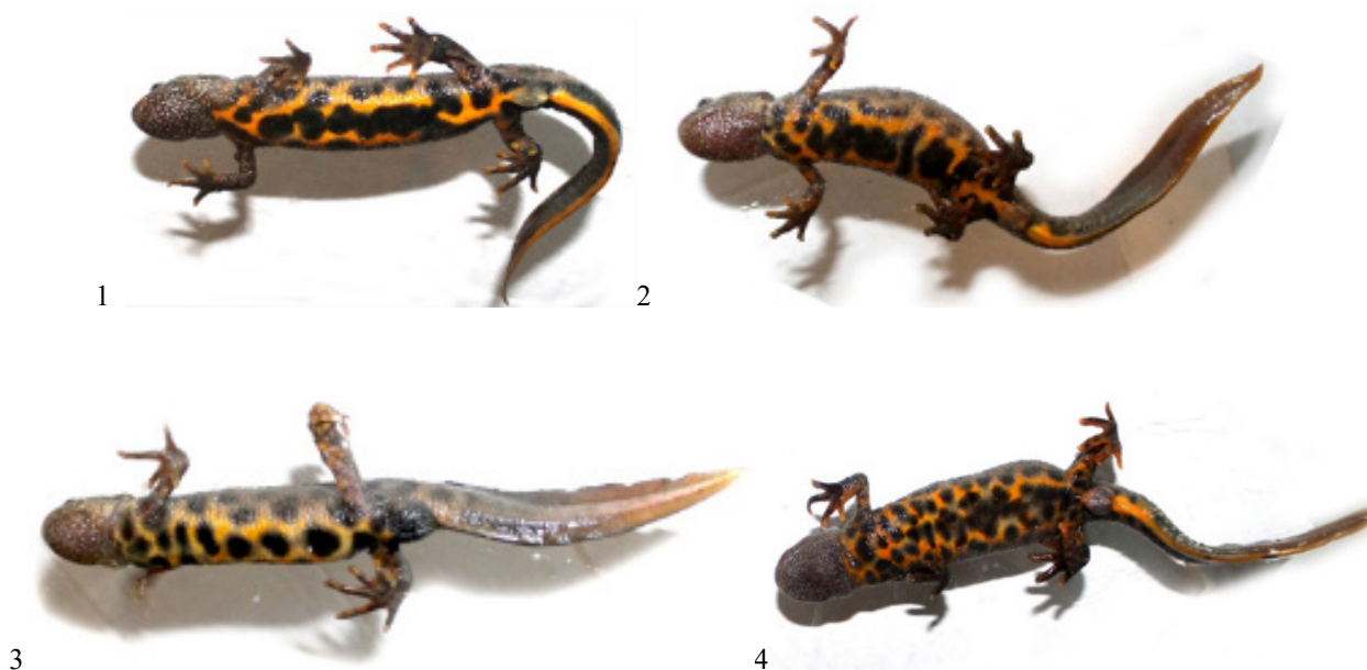
Figure 2. Ventral view pictures of captured individuals; numbers correspond to the numbers in the table above

The possibility that the discovered populations belong to T. macedonicus or T. dobrogicus , which are morphologically similar species, is rejected due to: