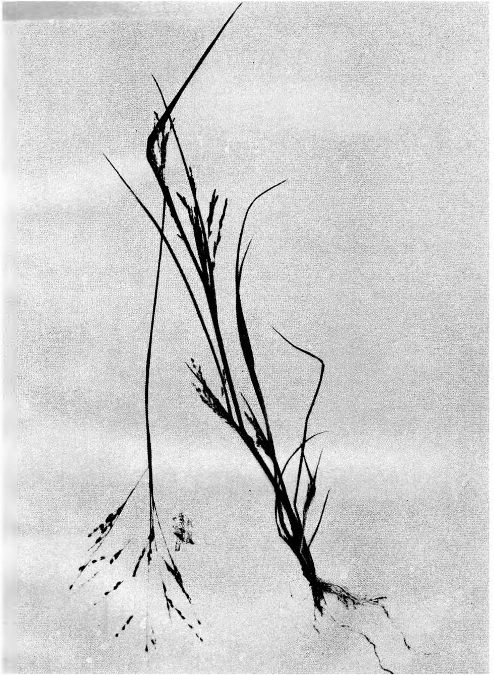
Fig. 2. Panicum dichotomiflorum Michaux from Selce (Turopolje) in the surroundings of Zagreb