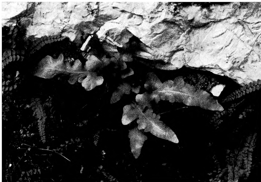
Fig. 2. Phyllitis hybrida (Smreĉje, 08. 12. 1982)