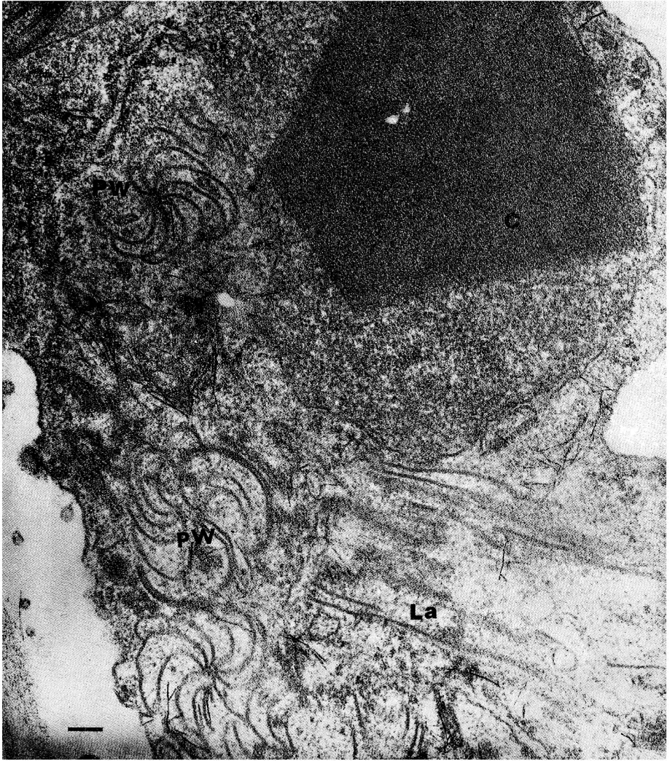
Fig. 2. Ultrathin section of Nicotiana tabacum leaf cell infected with T1 isolate; cylindrical inclusions in transverse section appearing as a pinwheel (Pw) and in longitudinal section as a laminated aggregates (La); C — transverse section of a crystalline structure. Bar represents 100 nm.