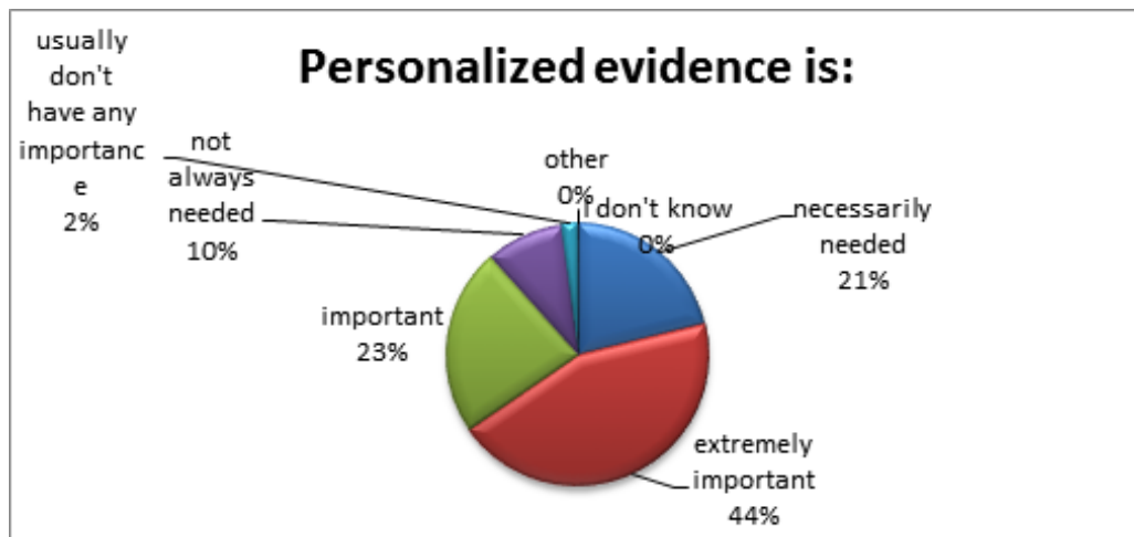
Graph 2: Personalized evidence is

From these data it can be concluded that 88.5% of respondents considered that personal evidence is important, extremely important and necessary for conducting the investigation, and only 11.5% believe that it is not always necessary for the investigation and have no importance. So, however operatives believe that personalized evidence is a significant part of criminal investigations and devote the attention within its operations. When questioned about the theoretical knowledge to perform conversations with people 21.2% of respondents believe that their knowledge is excellent, 40.4% that is very good, 30.8% good and 7.7% insufficient. Their knowledge can be improved as follows: most of the respondents believe that the knowledge in the field of performing interviews with individuals can widen with lectures from prominent experts, practical training, and with enrichment of theoretical knowledge, while a smaller number included field work, seminars and workshops.