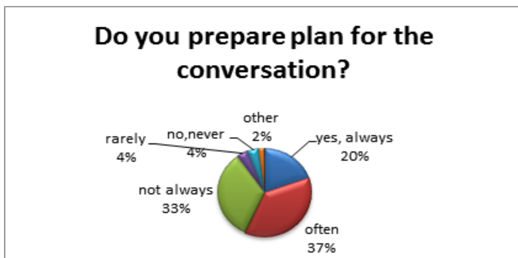
Graph 1: Do you prepare plan for the conversation?

The results show that although one of the most important criminalistics rules is planning, 57% of respondents often and always make plans, while the remaining 43% rarely or never make plans. This indicates the incomplete preparation for performing a conversation where they should also prepare a plan with certain questions, to plan the time, place, means and other circumstances, which is omitted in practice.