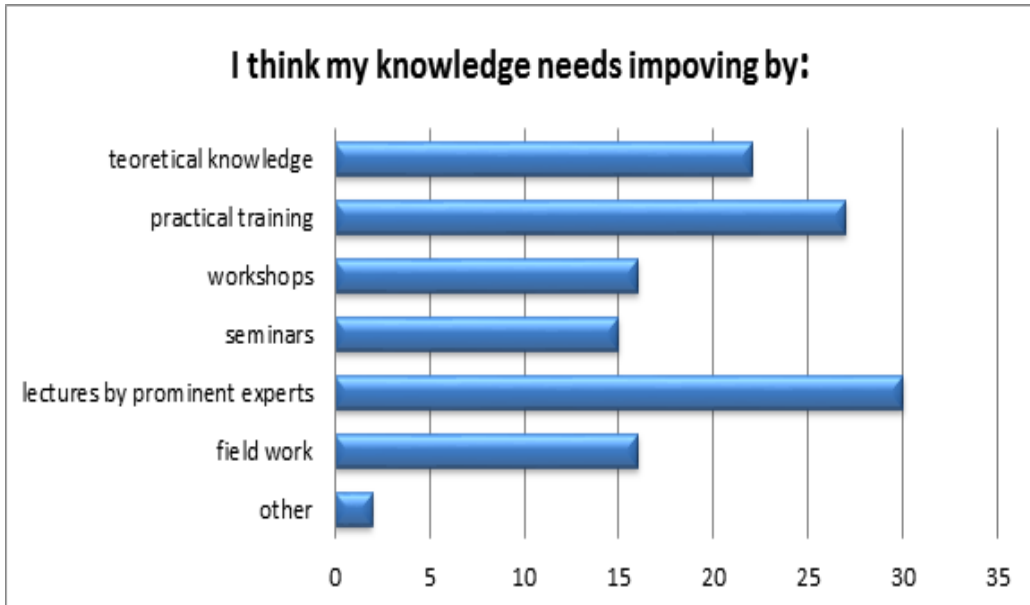
Graph 3: I think my knowledge needs improving by

One of the important questions the respondents were asked about is the importance of personal evidence regarding the material evidence. Thus, the question is: Do you agree with the statement that the material evidence have greater importance than personal evidence? The answers are rated on a scale from 1 to 5, "strongly disagree", -1 to 5 "totally agree". The given answers are: