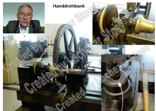
Figure 3 Stills protected with a watermark from two video lectures

The filming of the lecturer during the whole presentation, as well as the protection of his figures with semi-transparent water mark shown in Fig. 3 [8] guarantee his copyrights.