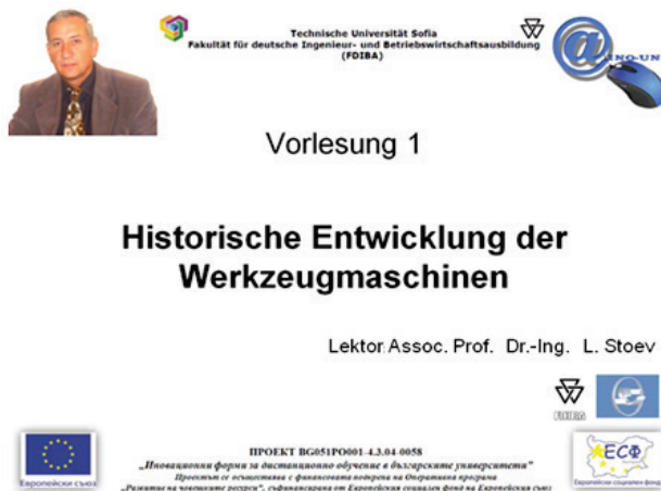
Figure 1 Exemplary slide from a video presentation [4]

The starting still of an example video lecture in German on the subject "Historical development of machine tools" is presented in Fig. 1 [4]. The standard arrangement of the information for each slide is given. Usually in the upper left corner of the screen the lecturer is recorded during his/her comments.