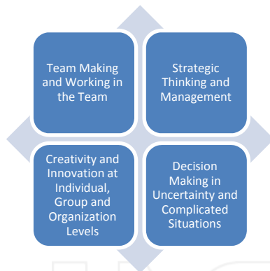
Figure 2. Fields of study for identifying criteria

identified and detected from the literature in four different fields (figure 2).