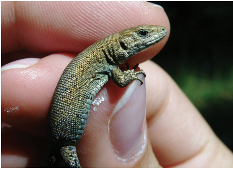
Fig. 2. Specimen of Zootoca vivipara from the Laborščak locality.