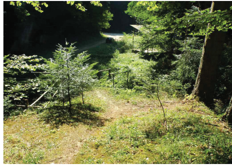
Fig. 3. Habitat of Zootoca vivipara at the Lepa Bukva record locality (222 m a.s.l.).

ment Gornji Macelj (three individuals, Fig. 2). This location is situated between 380–425 m a.s.l., in a forest dominated by beech and individual trees of chestnut and fir, and lower vegetation consisting of fern and small patches of grass. No other reptile species was recorded on the site. The Lepa Bukva location (N 46.238822°, E 15.85024°), also near the settlement of Gornji Macelj, is a mixed forest of beech and fir, with a small grassy clearing, in the vicinity of a small creek (Fig. 3). Altitude range extends from 190 to 240 m a.s.l. On this site more than 30 individuals of the Common Wall Lizard Podarcis muralis and five specimens of Zootoca vivipara were observed.