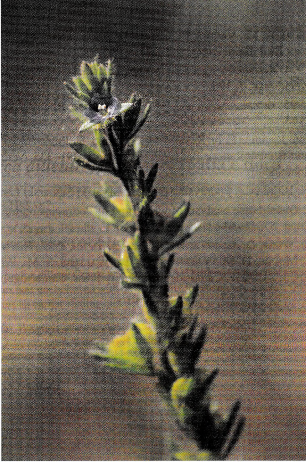
Fig. 2. Veronica dillenii Crantz - Đurđevac Sands Botanical Reserve, May 11 1999.

Latourr., Euphorbia cyparissias L., Cerastium semidecandrum L., Rumex acetosella L., Bromus tectorum L. Viola kiaibeliana Schult., Cytisus scoparius (L.) Link, Hieracium echioides Lumn., Corynephorus canescens (L.) P. Beauv., Potentilla incana P. Gaertn., B. Mey. et Scherb., Linaria genistifolia (L.) Miller, Alyssum montanum subsp. gmelinii (Jord. et Fourr.) Thell., Peucedanum cervaria (L.) Lapeyr.