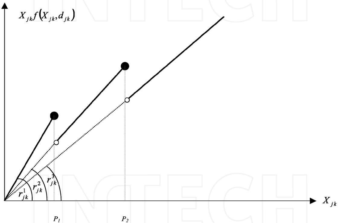
Figure 2. Transportation cost function

where r_{jk}^1 = E\beta_{jk} , r_{jk}^2 = E\alpha_1\beta_{jk} and r_{jk}^3 = E\alpha_2\beta_{jk} are the slopes of function X_{jk}f(X_{jk}, d_{jk}) , as shown in Figure 2: