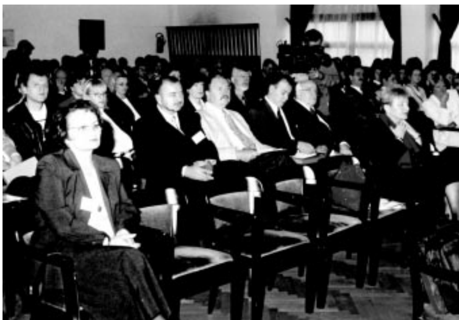
Fig. 3. Participants of the Congress