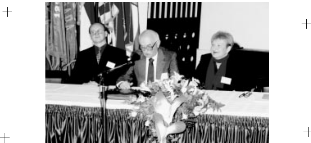
Fig. 2. Presidency of the Congress

The following posters were proclaimed most successful according to the evaluation by poster section moderators: